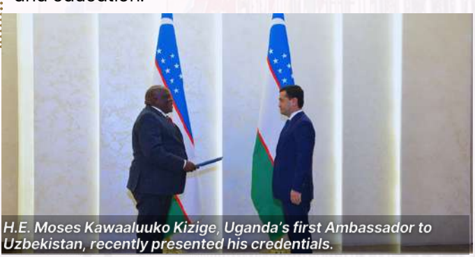
Compiled by Amiri Wabusimba Courtesy photos

The event featured a Guard of Honour by the Bangladesh Army's Special Security Force Regiment, followed by a meeting between the High Commissioner and the President. The two discussed high-level visits to enhance bilateral relations, exploring collaborations in agriculture, foreign affairs, defense, and waiving visa requirements for diplomatic and official passport holders. High Commissioner Kikafunda highlighted investment opportunities in Uganda's agroindustry, particularly in the cotton value chain, and encouraged partnerships in pharmaceuticals, ICT, and education.