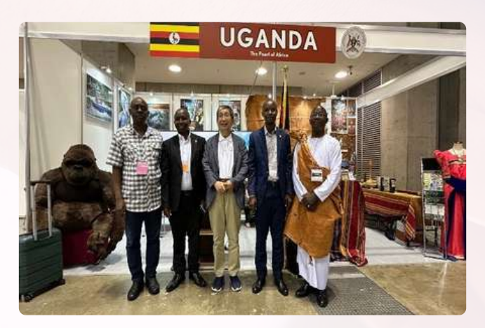
Amb. Kazuaki Kameda, Secretary General of Japan Platform and former Honorary Consul of Uganda in Hokkaido Prefecture at the TEJ 2024

The Ugandan presence at TEJ 2024 effectively promotes the country's sights and sounds to potential Japanese travelers and partners. This positive exposure boosts Uganda's profile within the vital Asia tourism market.