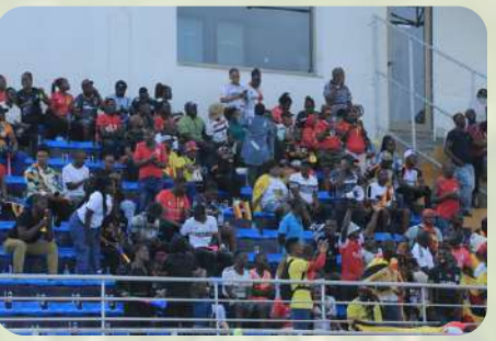
Pictured L-R: The Crane Stars at Juba Stadium before the match; Uganda' supporters in the stands ready to show their support to the players