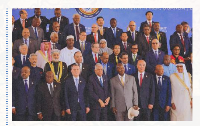
Heads of State and Senior officials at The Non-Aligned Movement summit earlier this year in Kampala.

The outcomes of these negotiations are set to influence future sessions and the broader dialogues within international diplomatic circles. As nations reconvene to address these critical issues, the precedence set by Uganda's Chairmanship at this session will likely serve as a guiding example for effective multilateral negotiations.