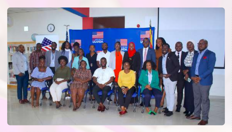
The 2024 Mandela Fellowship Alumni in a group photo after the Debrief session at the American Centre in Kampala.