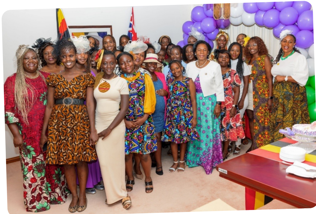
High tea event honoring the female staff at the Women's Day celebrations Ugandans mission in Canberra