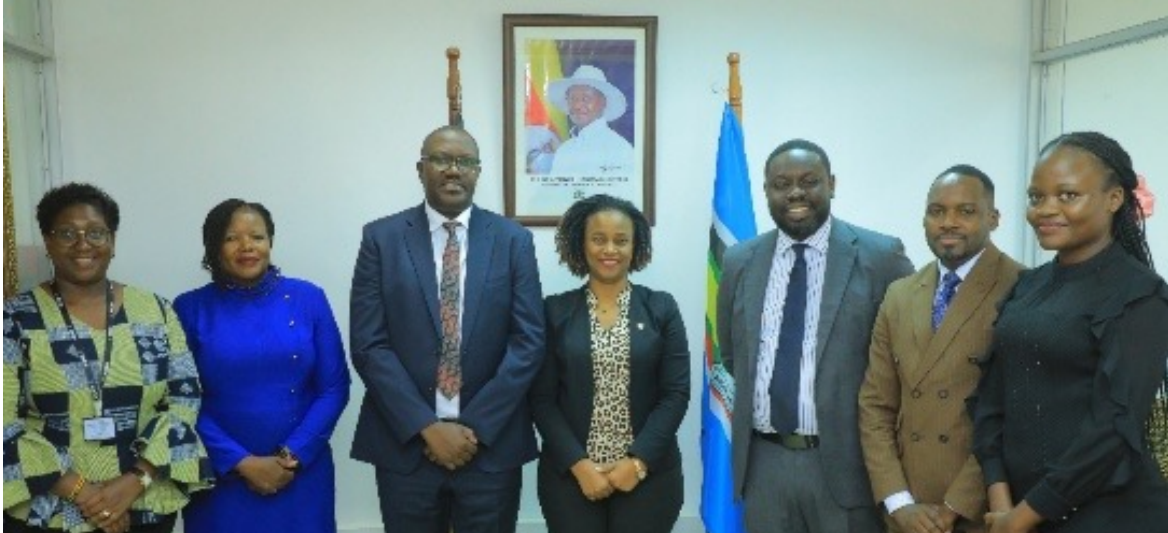
Dignitaries from MOFA and Stanbic bank posing for a group photo after the Strategic engagement.