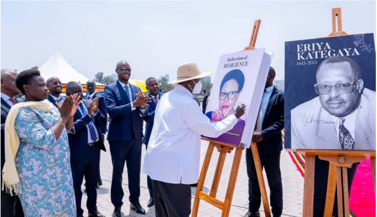
H.E. President Museveni signs the two books that were launched in Kategaya's honor. On the left, the Vice President H.E. Jessica Alupo.

President Yoweri Kaguta Museveni honored the late Rt. Hon. Eriya Kategaya as a pioneer of patriotic politics in Uganda during a memorial service held on 6th March 2025 at Kololo. He described Kategaya, Uganda's former First Deputy Prime Minister, Minister of Foreign Affairs (1996-2001) and Minister of East African Community Affairs as a strong advocate for nationalism and unity.