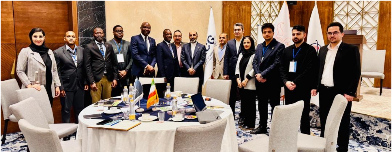
Delegates at the Iran-Africa Economic Summit on Kish Island posing for a group photo.

The Embassy of the Republic of Uganda in Tehran recently participated in the 1st Iran-Africa Economic Conference, held on Kish Island from February 25-27, 2025.