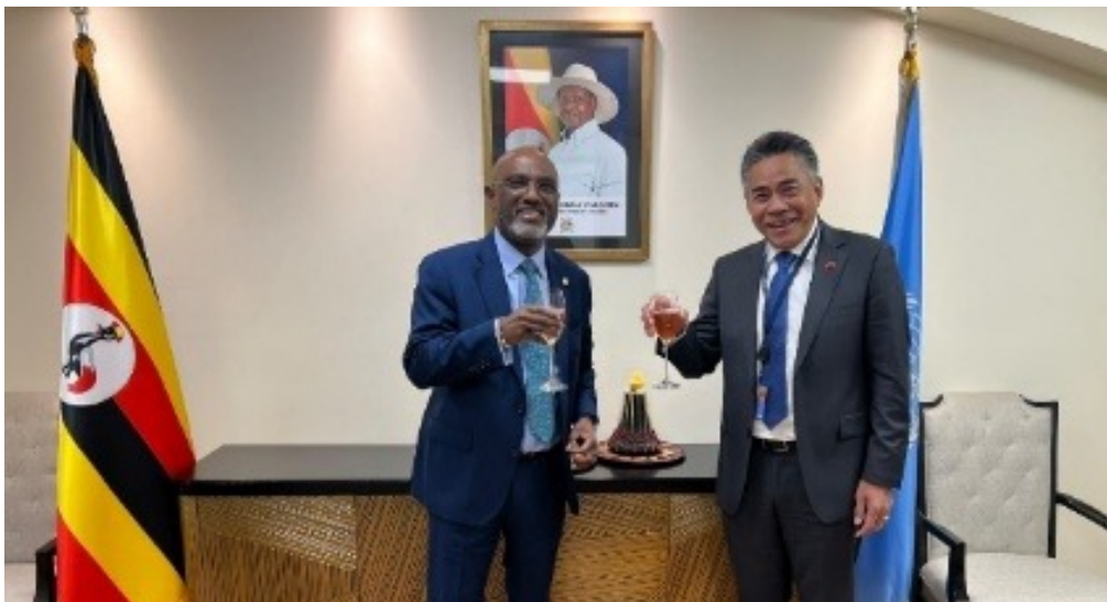
H.E. Amb. Adonia Ayebare, Permanent Representative of Uganda to the United Nations with H.E. Amb. Fatumanava-o-Upolu III, Permanent Representative of Samoa to the United Nation after signing a Joint Communiqué establishing diplomatic relations.

The Republic of Uganda and the Independent State of Samoa signed a Joint Communiqué, establishing diplomatic relations between the two nations on March 8, 2025. This significant development is set to promote and strengthen ties of friendship and cooperation between Uganda and Samoa.