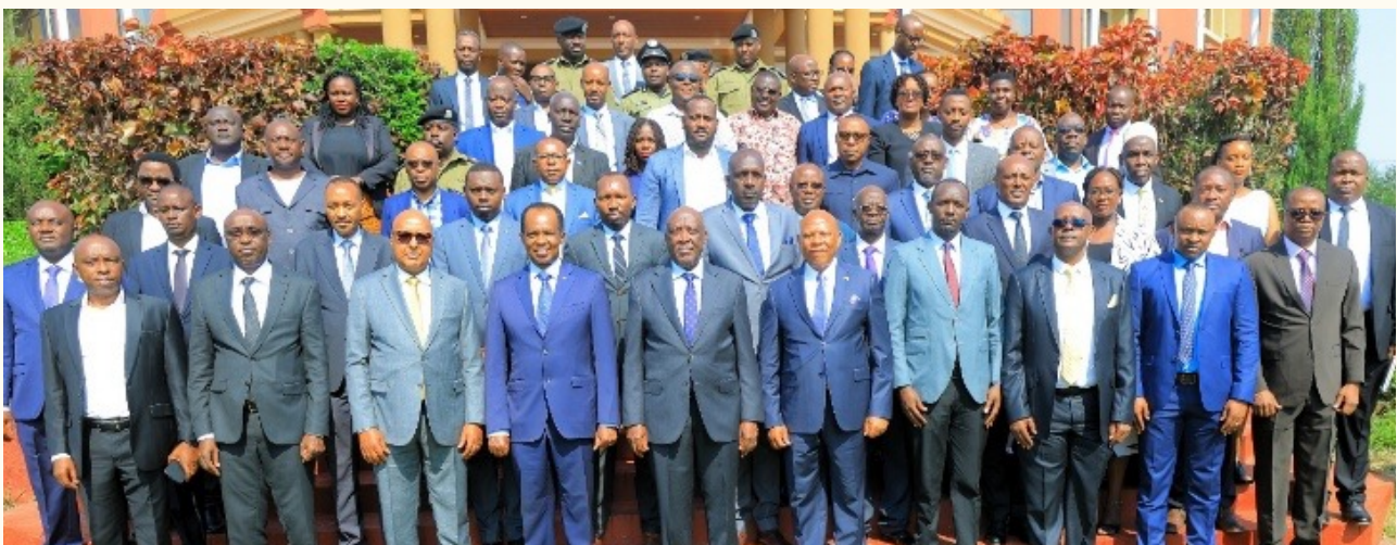
Group photo of delegates at the 3rd Uganda-Rwanda Cross-Border Security Meeting in Mbarara.

In a significant move to bolster regional security, Uganda and Rwanda held their 3rd Cross-Border Security Meeting in Mbarara on February 27, 2025.