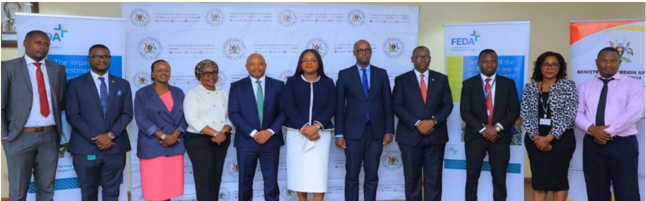
Group photo of delegates at the Official signing ceremony of the FEDA Accession Instruments at the Ministry of Foreign Affairs.

Kampala, Uganda - In a significant move to strengthen Africa's economic ties, Uganda has officially joined the Fund for Export-Development in Africa (FEDA) as its 21st member state. This milestone was marked with the signing of FEDA's Establishment Agreement in Kampala on March 6, 2025.