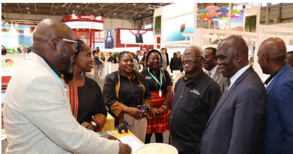
Minister for Tourism, Wildlife and Antiquities, Hon. Tom R. Butime (C) and Head of Mission, Uganda Embassy in Berlin H.E. Ambassador Stephen Mubiru (1L) at the ITB Berlin 2025 Expo.

Uganda's presence at ITB Berlin 2025 reinforced its commitment to growing its global tourism market. By showcasing its breathtaking landscapes, diverse wildlife, and vibrant cultural heritage, Uganda positioned itself as a top travel destination. The exhibition also served as a platform for networking, business partnerships, and expanding Uganda's footprint in the international tourism industry.