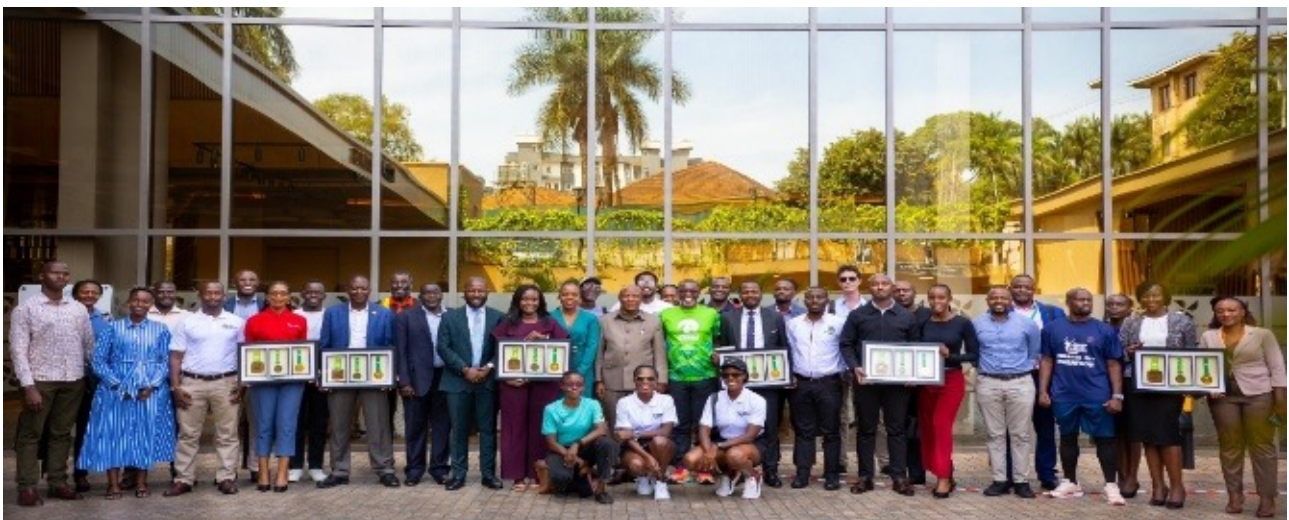
Group photo during the stake holder's engagement at 4 points hotel by Sheraton in Kololo

Tourism in the region saw remarkable gains, with 70% of participants extending their stay to explore iconic attractions such as Queen Elizabeth National Park. This extended visitation translated into additional revenue for local tour operators and conservation efforts. Meanwhile, the marathon's health impact was undeniable, with 98% of participants achieving their personal fitness goals, reinforcing the event's role in promoting wellness and active lifestyles.